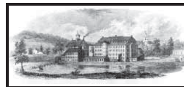
Image of the Boston Manufacturing Company from the first Bank Note c. 1836

The lecture will be preceded by a brief business meeting of the Society. Light refreshments will be available at the conclusion of the lecture.