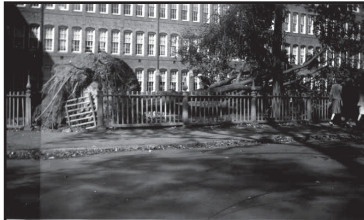
Waltham Watch Factory after the 1938 Hurricane — Facing the building

On September 21, 1938, a massive hurricane hit New York and New England, to the surprise of all residents. The Great New England Hurricane, one of the most destructive storms in American history, caused more than six hundred deaths and $400 million in property damages. What made this storm unique? In this illustrated lecture, learn about the impact and aftermath of the Hurricane of 1938 in southern New England.