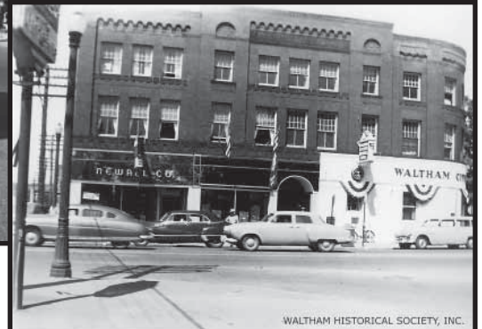
PARMENTER BUILDING ERECTED 1879 • BURNED 1999