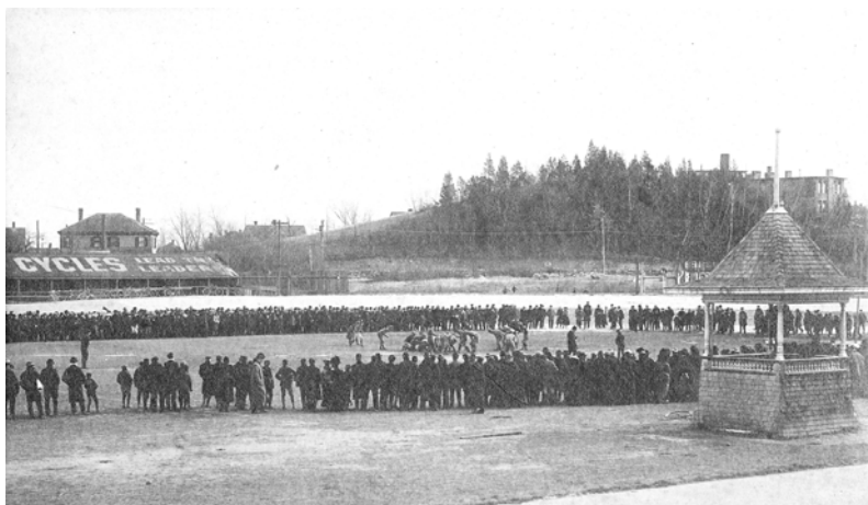
Bicycle Park with Waltham Hospital in background, Circa 1900