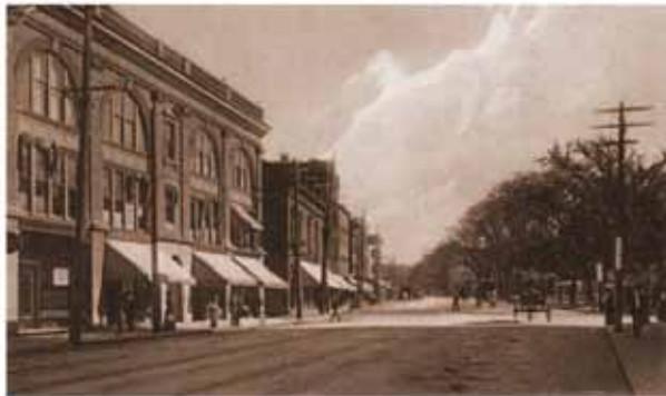
The Lawrence Building • 677 Main Street Waltham, Massachusetts phone: 781-647-4019