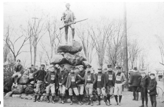
The Roadsters at Lexington, April 1900