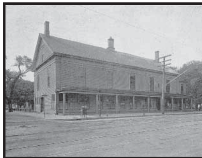
Rumford Hall, the seat of City government in 1913

site, the appointment of Waltham's first female department head, the ice shortage crisis, the shocking new Turkey Trot dance, police raids on liquor dealers, and the Metz championship car.