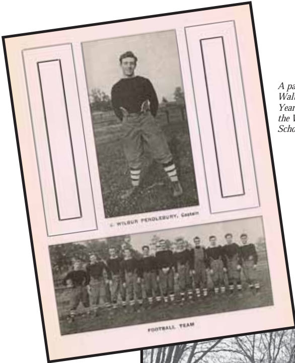
A page from the Waltham High School Yearbook featuring the Waltham High School Football Team