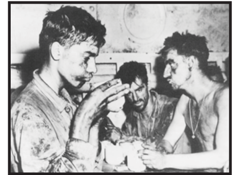
Here Marines relax with a hot cup of coffee on board ship after victoriously ending the bruising fight for Eniwetok. 18