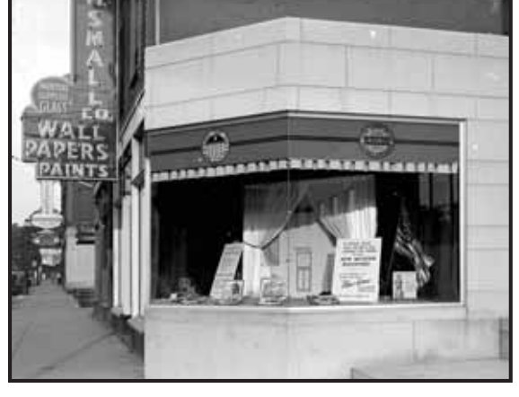
One of the many Moody Street window displays during the Second World War.