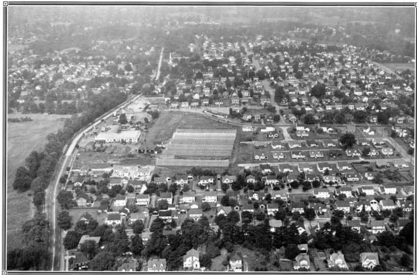
Aerial view of Warrendale area of Watertown / Waltham, circa 1950. Watertown Savings Bank currently operates its Warrendale Branch in this area.

Images from our collection that are always popular include aerial shots: