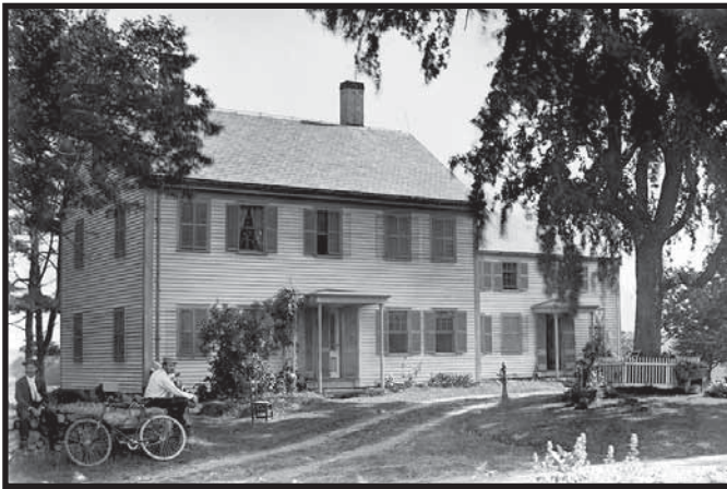
This print of the Wyman House was made from the digital image.