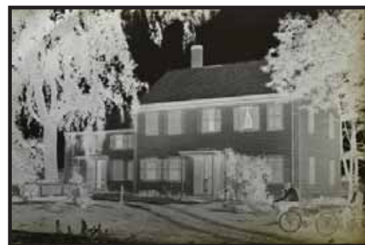
The raw image of the glass slide of the Reuben Wyman House, 1894, in the negative and inverted format.

Once the camera was positioned another aspect for concern is reflection of any ambient light in the room. Often-times the lights would need to be shut off to provide sufficient contrast to capture as much detail as possible.