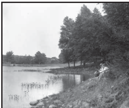
Images of Hardy Pond, 1904