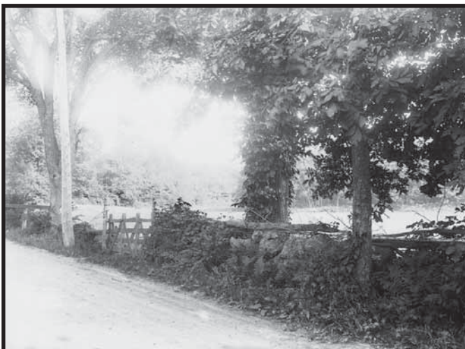
Lake Street image.

The effort of converting our 100 year old glass slides to digital format still has a way to go as we've recently received more glass slides to sort and identify.