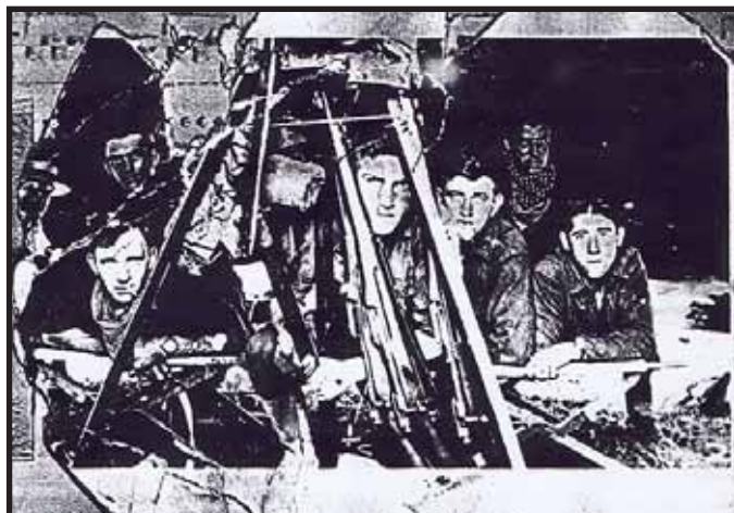
We're looking to identify the men in these photos. The photo above is from El Paso and is marked First Corps.