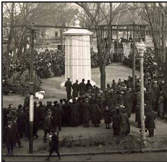
Dedication of the First World War ! Monument on Waltham Common in July 1927

The exhibit, at the former Bright School, 260 Grove Street in Waltham, will be open on Saturday mornings from 10:00 am to 1:00 pm. Call to learn of other hours or to make an appointment to visit.