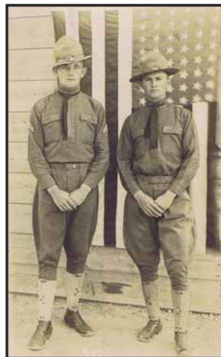
If you can identify any of them please contact us through the website.