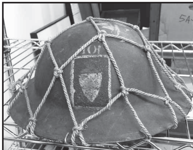
World War I helmet bearing the insignia of the 101st Regiment.

The Zimmerman Note spurred the US President to declare war on Germany on April 6, 1917. American shipping had been targeted by German U-Boats, with many ships being sunk or damaged. Combined with the offer to Mexico, President Wilson believed there was no option but to declare war on Germany.