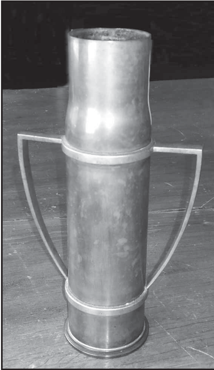
A Drinking Stein made from a spent shell