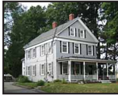
90 Church St., Smith-Pope House, 1830-1854, Greek Revival

The Waltham Historical Society, Inc. 190 Moody Street, Waltham, MA 02453