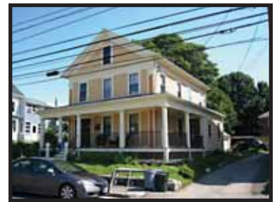
70 School St., Josiah Beard House, 1844, Greek Revival

The Josiah Beard House is an excellent example of the many gable-end-façade, side-hall-plan Greek Revival houses that were built in Waltham in the mid-nineteenth century. It retains many of its original features and finishes: a pedimented attic, full entablature, an unusual spade-shaped detail on the paneled corner boards, floor-length window architraves on the first floor, and an encircling portico supported by fluted Doric columns. The various ells on the south and west, the cross-gabled two story bay on the east, and the double front door are all probably later additions.