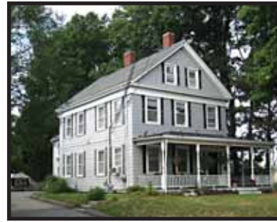
90 Church St., Smith-Pope House, 1830-1854, Greek Revival

The Waltham Historical Society, Inc. 190 Moody Street, Waltham, MA 02453