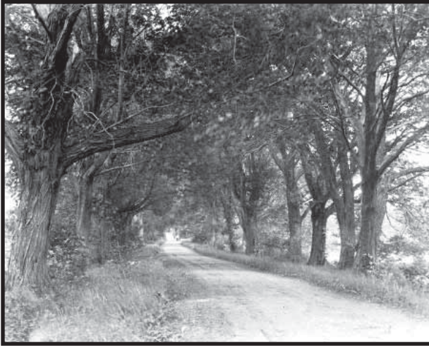
Trees and a broken fence on Trapelo Road