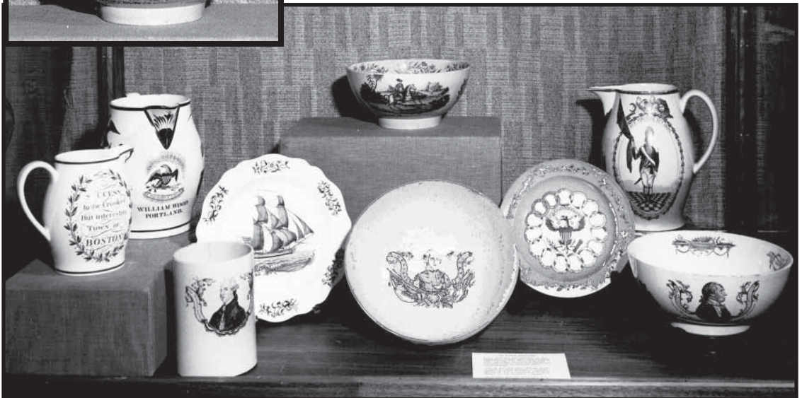
Pictured is the Society's "Barnes Bowl" as it was displayed at the Wedgwood Club's 1965 exhibition at Slater's Mills in Rhode Island