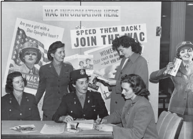
WAC enlistment November First, 1943