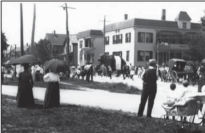
1903 Circus Parade on High Street

A few images in the collection of the Waltham Historical Society